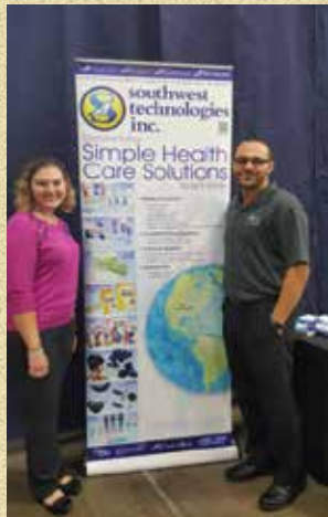
Visitors to the SWT Booth