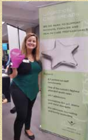
Members at CMSA showing support to punch out cancer